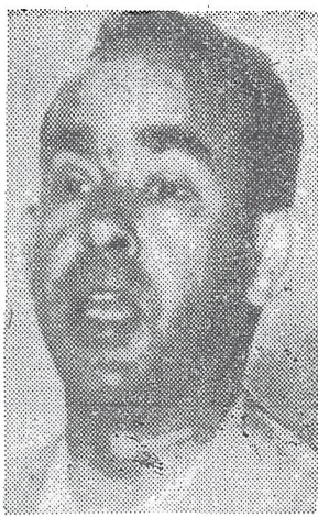
MEHDI BEN BARKA