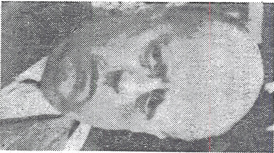
JACQUES FOCCART ...personalized power