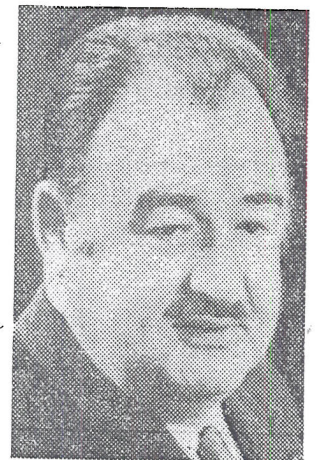
DE MARENCHES ...picked up the pieces

appear to operate under diplomatic cover as military attaches in embassies. In the past, much of their work has been confined to traditional intelligence-gathering, while covert operations were left to Foccart's network.