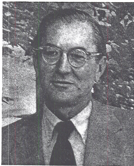
COLBY: CIA DIRECTOR

BECAUSE OF VOLUME OF MAIL RECEIVED, PARADE REGRETS IT CANNOT ANSWER QUERIES.