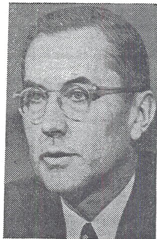
WILLIAM E. COLBY

... former and current CIA chiefs involved in changes.