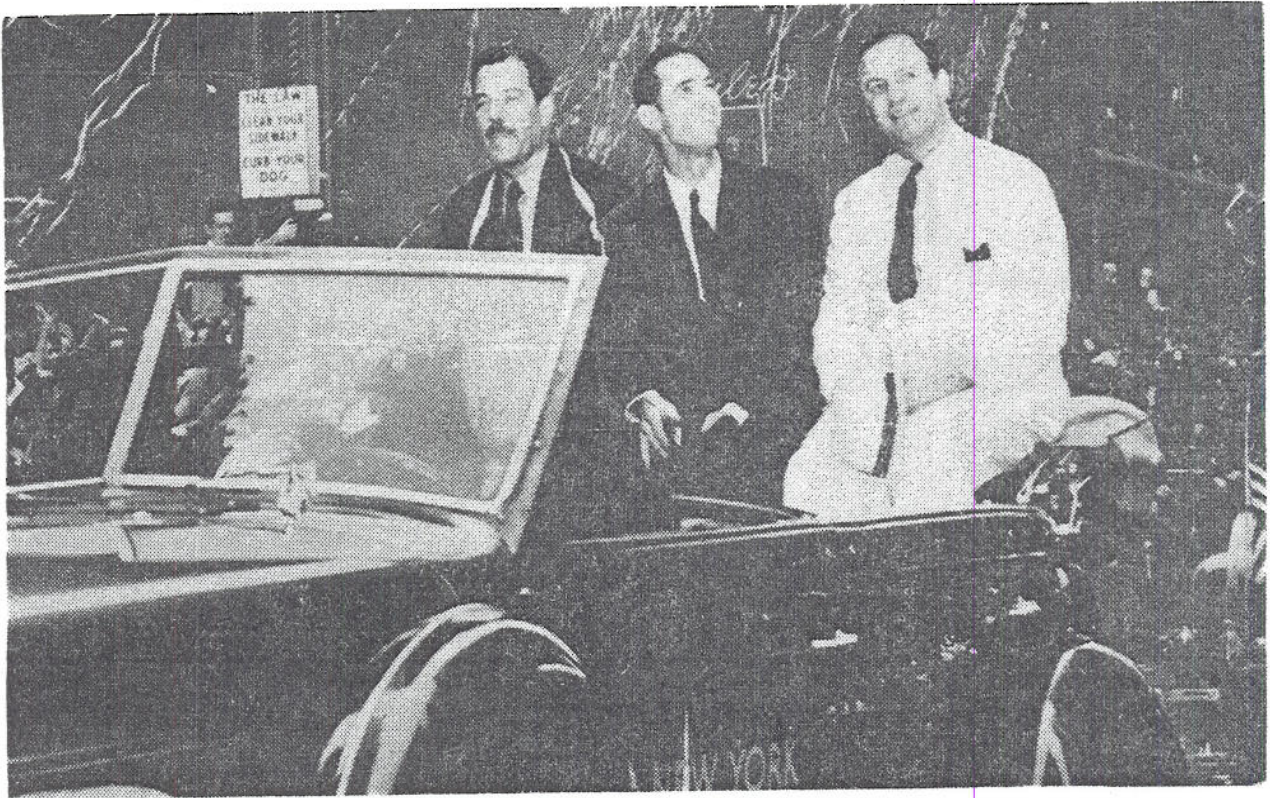
In 1938, Hughes was given a ticker-tape parade in New York City, recognizing his record-breaking around the world flight. The young Hughes, cap-