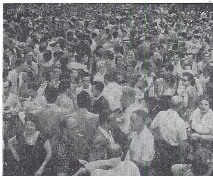
NEW YORK, JUNE 19, 1953: THE DAY TWO PEOPLE DIED