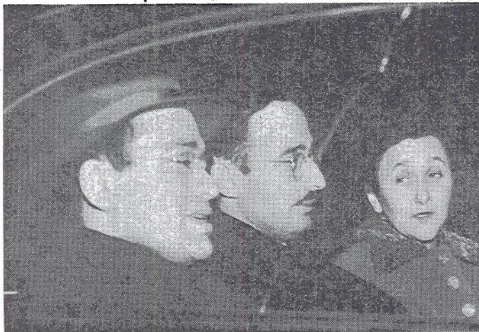
MARCH 29, 1951: ON THE EVE OF THE VERDICT Morton Sobell (left) and Julius and Ethel Rosenberg in prison car

Why Gold was worth weight in U-235 to FBI; fact, discovered on first visit to his home, that he had been in New Mexico in September, 1945, when he could have met Fuchs, and his "runaway imagination" and yearning for fame at any price. Showing equal indifference to his own and others' fate, Gold was stimulated into establishing "the authenticity and enormity