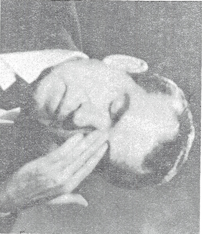
Richard Nixon gestured as he spoke to David Frost during the television interviews