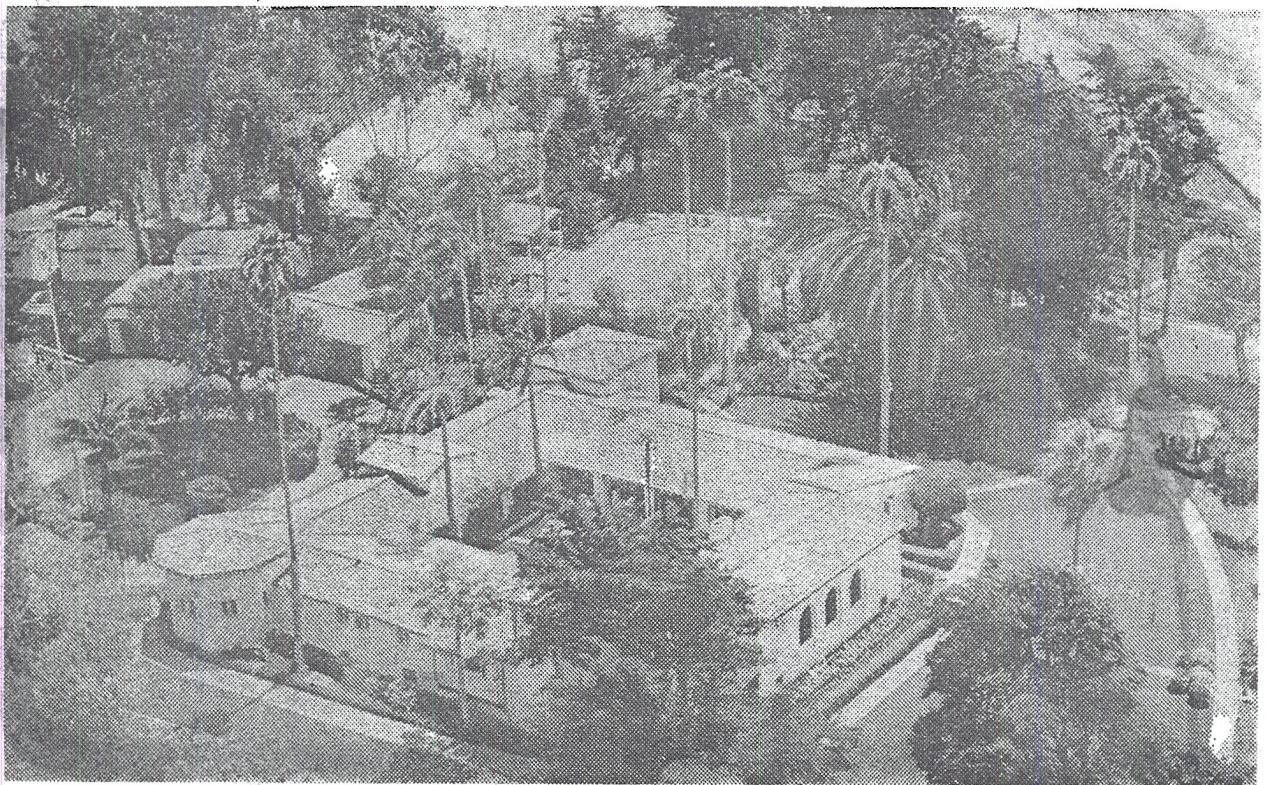
An aerial view of the ex-President's home at San Clemente

22 San Francisco Chronicle ★★ Fri., Aug. 30, 1974