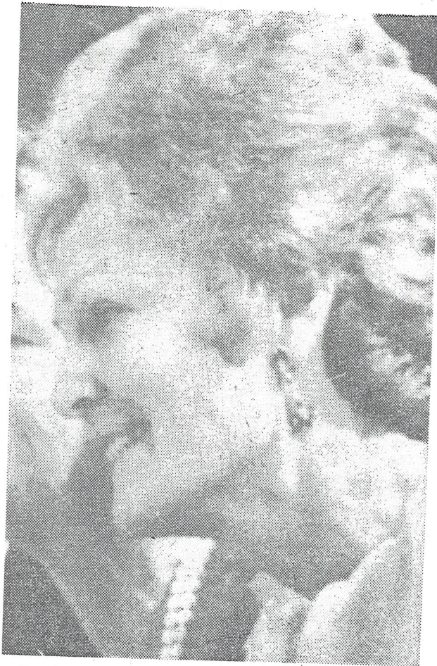
Pat Nixon wearing diamond and emerald earrings given to her by Prince Fahd in 1969. The occasion is Mrs. Nixon's birthday celebration at the White House in March, 1973.