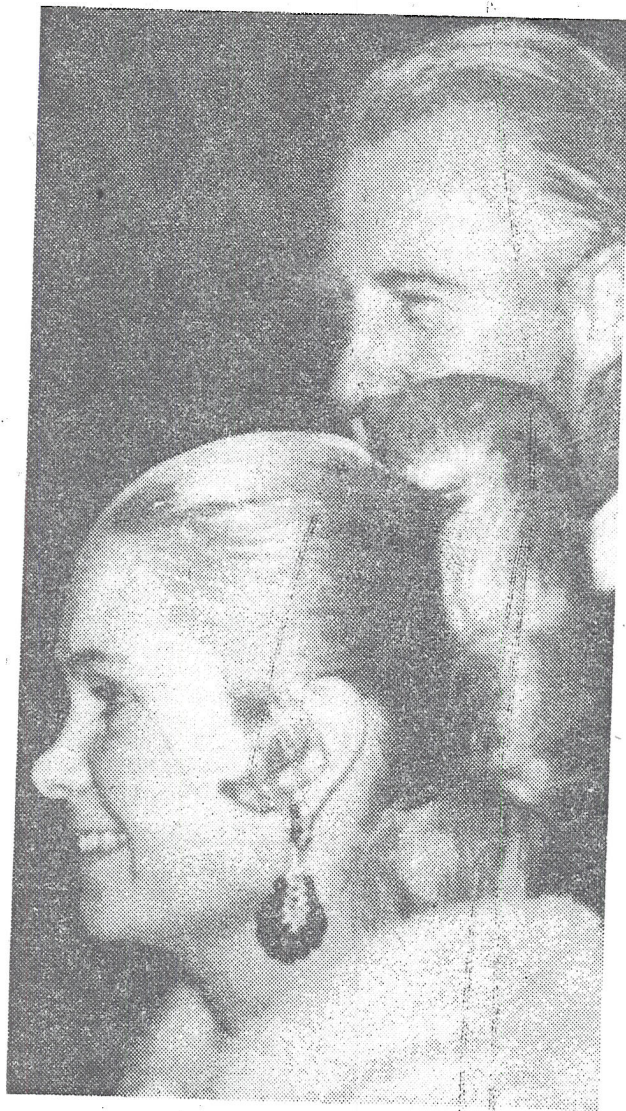
Tricia Nixon Cox wearing ruby and diamond earrings given to her mother in 1971 by King Faisal. The occasion is a $1,000-a-plate dinner which Mrs. Cox appeared at with former Vice President Spiro T. Agnew in March, 1972.