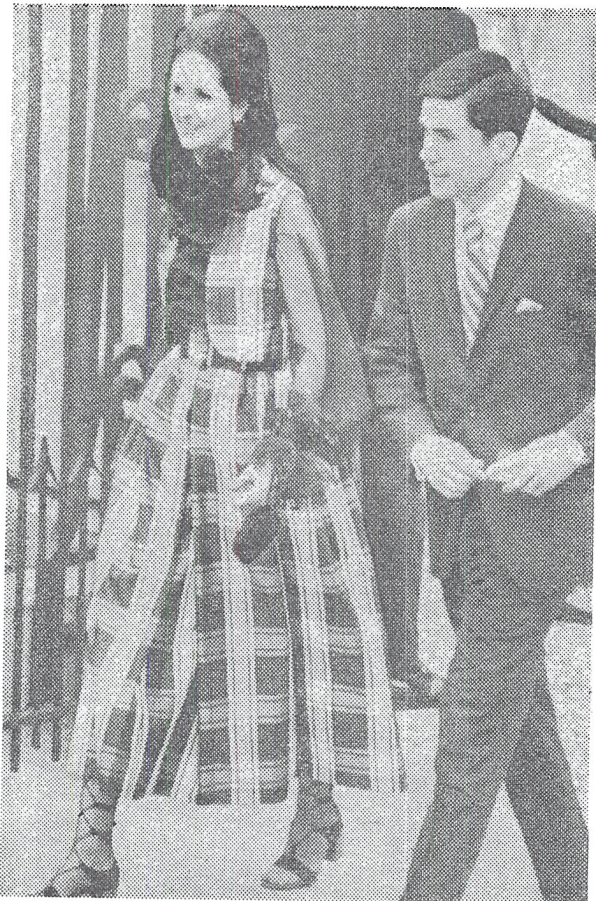
MAJOR AND MRS. CHARLES S. ROBB, GUESTS As Lynda Johnson, she too was a White House bride