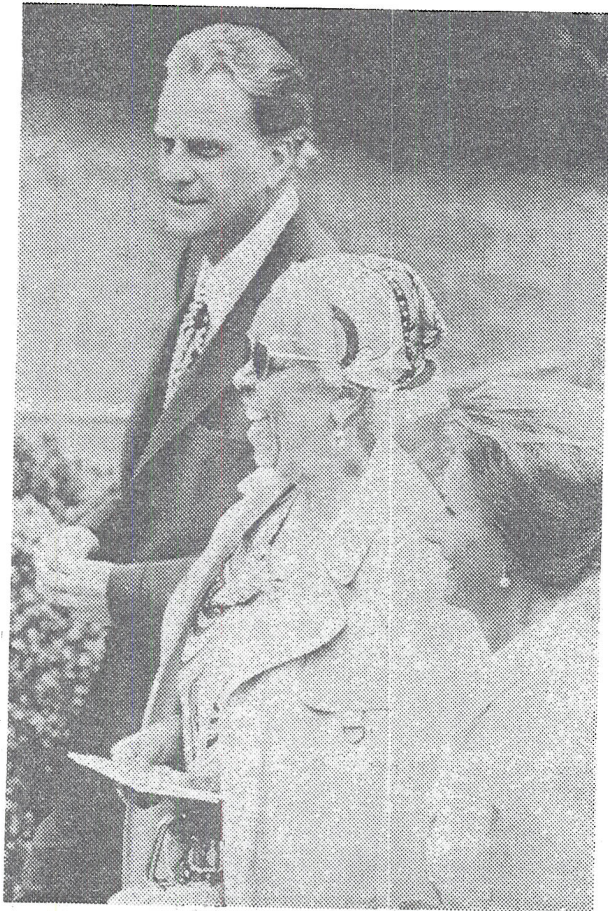
DR. AND MRS. BILLY GRAHAM WERE THERE They escorted an old friend, singer Ethel Waters

There were plenty of relatives from both families, enough to fill about 40 seats, reserved for them in the first four rows at the wedding. Nixons were on the left and Coxes on the right, facing the altar.