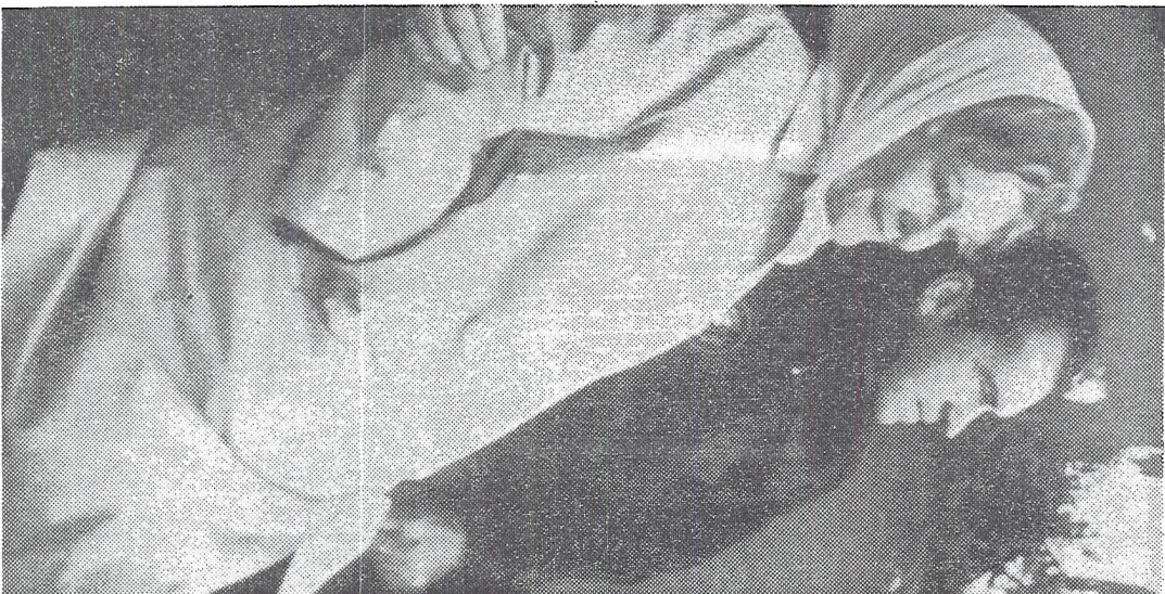
Mr. Nixon put an arm around his wife, who had borrowed a maid's coat and scarf for a walk