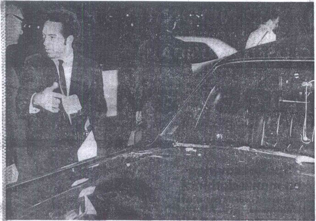
NEWSMEN VIEW DEBRIS ON PRESIDENT'S LIMOUSINE AFTER RETURNING TO SAN JOSE AIRPORT In confusion some papers carried photo taken before the violence. It showed no marks