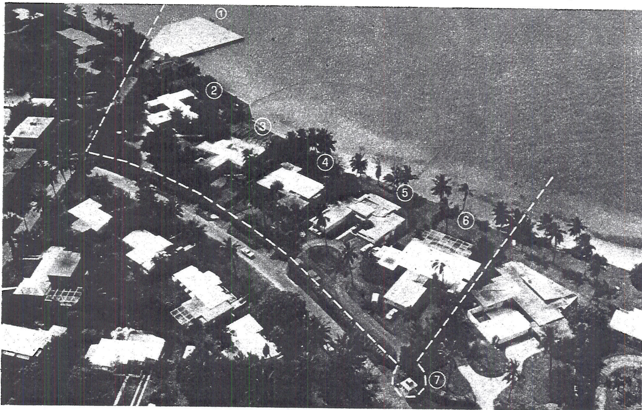
Aerial photo of Nixon Key Biscayne compound, inside dotted line: (1) helicopter pad; (2) 516 Bay Lane, the former President's office; (3) 500 Bay Lane, Nixon's house; (4) 490 Bay Lane, Bebe Rebozo's house; (5) 478 Bay Lane, Robert Abplanalp's house; (6) 468 Bay Lane, house belonging to Abplanalp's lawyer, Ed Campbell, formerly leased to the Secret Service, and (7) guard house.

BECAUSE OF VOLUME OF MAIL RECEIVED, PARADE REGRETS IT CANNOT ANSWER QUERIES.