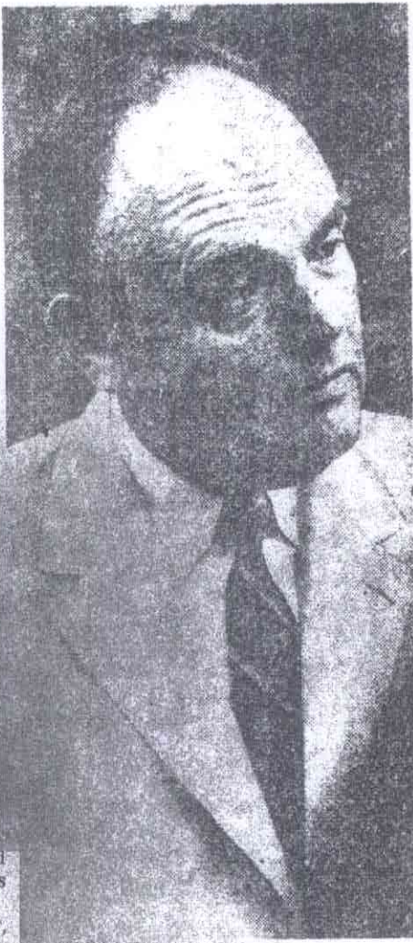
...The Washington Post