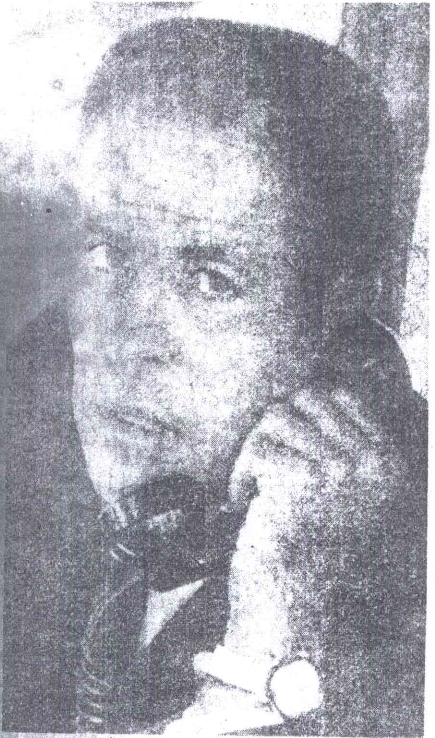
H. R. Haldeman: The first man to see the President officially every morning, the last to see him every night.

is careful to stay out of the public eye he has been thrust into rare prominence by charges linking him to a fund allegedly used in part to underwrite a sabotage campaign against Democratic presidential candidates. The White House has denied that Haldeman had access to such a fund.