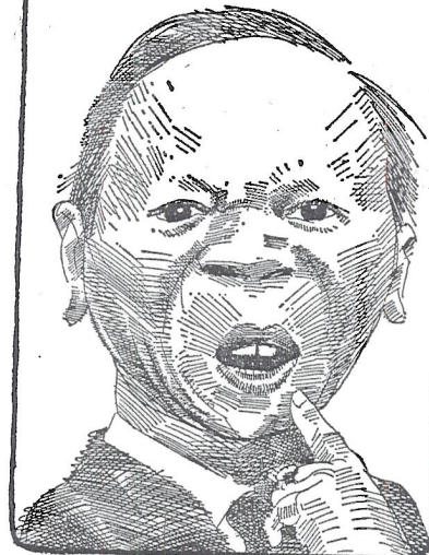
Drawings by Robert Pryor

wearing a blue suit and dark (possibly black) tie. His shirts on both occasions were blue. No one here, however, thinks that a peace settlement is likely soon."