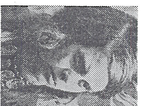
The faces of Flamingo Park . . . youth gathers at GOP convention