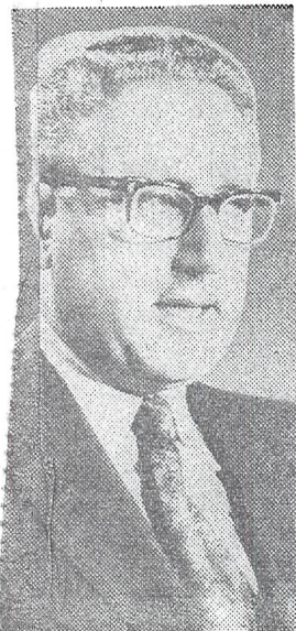
HENRY KISSINGER Bathed in publicity

Ehrlichman was in Stockholm recently as a member of the U.S. delegation to the World Environmental Conference. On his return he told Nixon the press had ex-