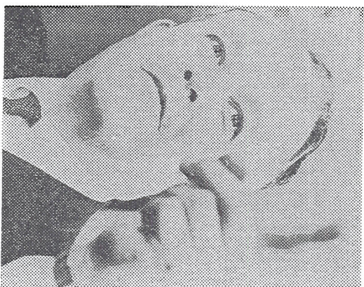
Richard J. Kleindienst Caught in struggle

Such implacable opponents of Kleindienst have allies in Congress for entirely non-ideological reasons, based on nothing more than Kleindienst's power to make or withhold recommendations of all federal judgeships. A stickler for form, Kleindienst has leaned heavily on the recommendations of local bar associations, only to find himself on the receiving end of outraged senators whose