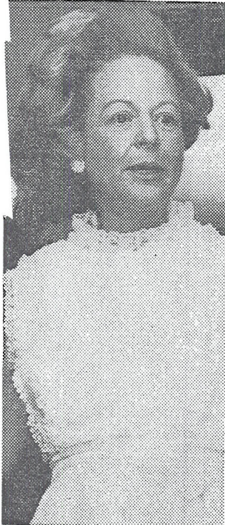
United Press International