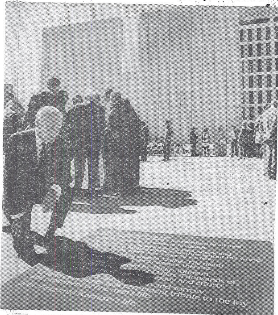
Philip Johnson pausing by a plaque in front of John F. Kennedy memorial he designed that was dedicated in Dallas yesterday. Spot is near site of President's assassination.

memorial commission that pushed the project. Another outside plaque will read: "The joy and excitement of