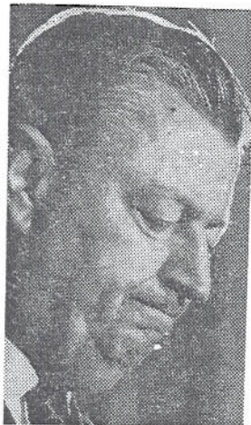
DR. CARL McINTIRE ... "I will go to jail"

Six regular crew and two radio technicians are aboard now, awaiting word from McIntire to hoist an American flag and turn on the 10,000-watt transmitter. Some programs will be broadcast live from the ship, with speakers and guests brought aboard by small boats. Among those he intends to invite—to demonstrate fairness without a fairness doctrine—include antiwar activist Jane Fonda, Sens.