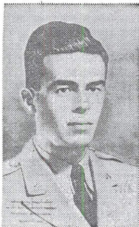
The John Birch Society