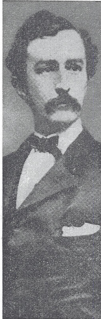
JOHN WILKES BOOTH, the President's assassin.