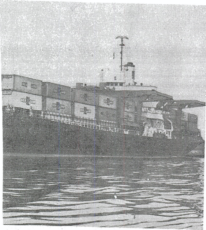
to dock in Cambodia yesterday, on an earlier voyage