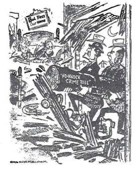
"Relax, Folks—We're Wearing White Hats"