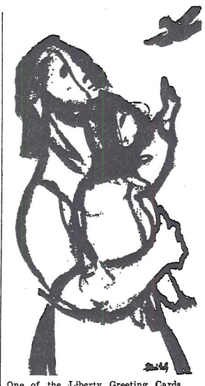
One of the Liberty Greeting Cards