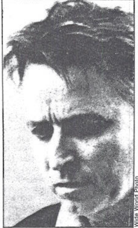
James Earl Ray, convicted slayer of Martin Luther King, wants a new trial.