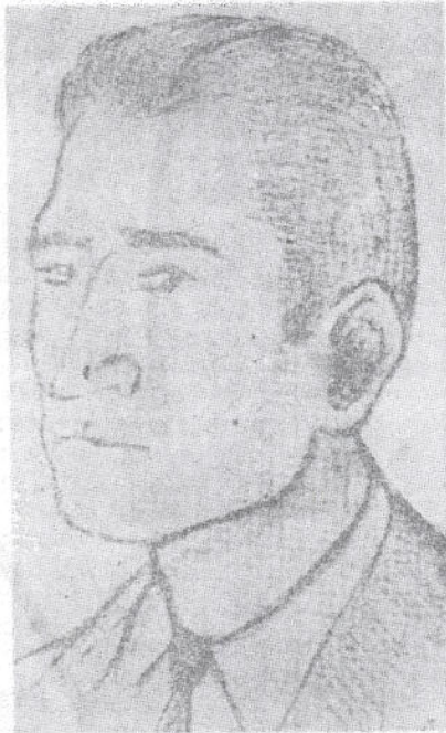
THE MEXICAN SKETCH

Ex-FBI agent found the similarities striking