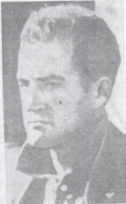
THE DALLAS SUSPECT

Ex-FBI agent found the similarities striking