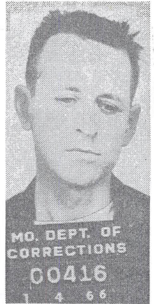
JAMES EARL RAY Picture from a prison

The FBI's description of Ray was much more detailed than that given for Galt. Ray was said to be about 5 feet 10 inches tall and to weigh about 163 to 174 pounds. He has blue eyes, brown hair and a small scar on the cen-