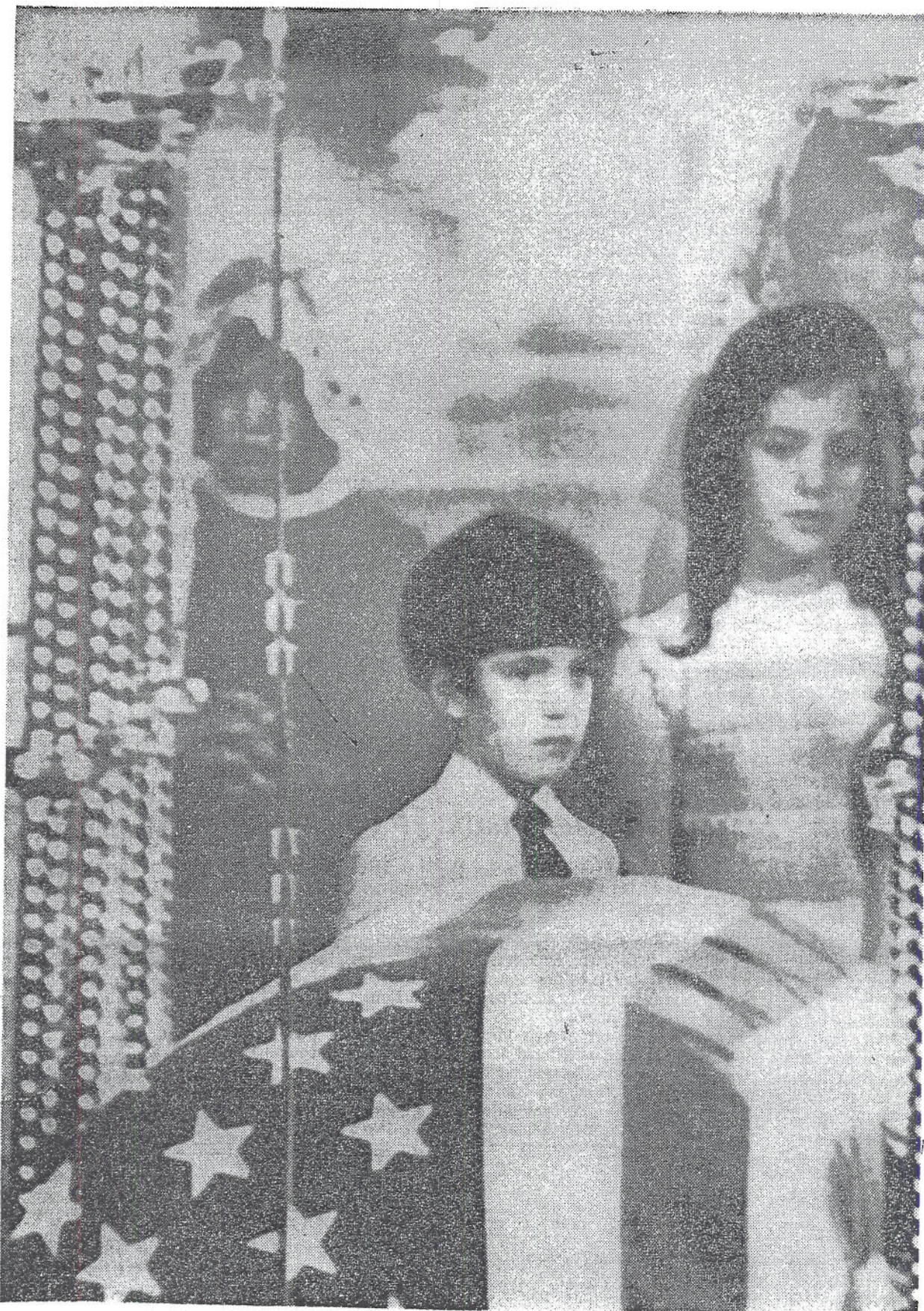
Children, pre-eminent in Kennedy lives, formed a tender, moving group at the funeral. Caroline and John (above) relived a casket scene of 4½ years ago. Mrs. Pat Lawford, a sister, and other Kennedy children (below) knelt at funeral mass.