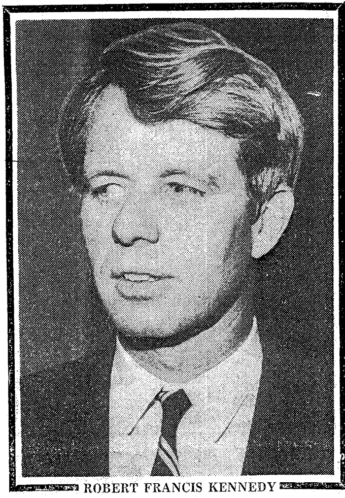
ROBERT FRANCIS KENNEDY