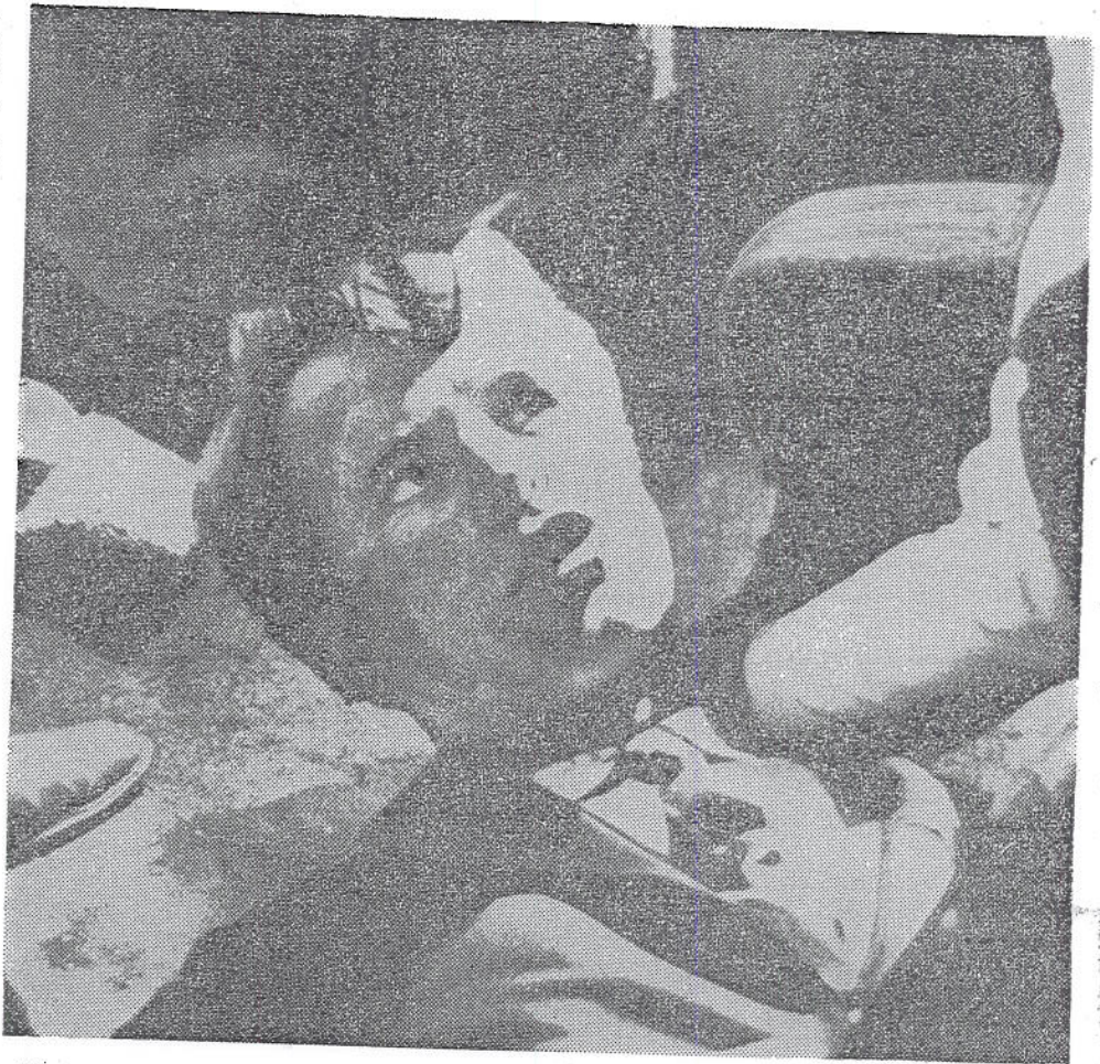
Eyes open and seemingly conscious, Kennedy lies on floor moments after

"The horror of it is that political assassination in this country is becoming as common as it is. America has to reorient and take stock of itself that this has become so common in our public life."