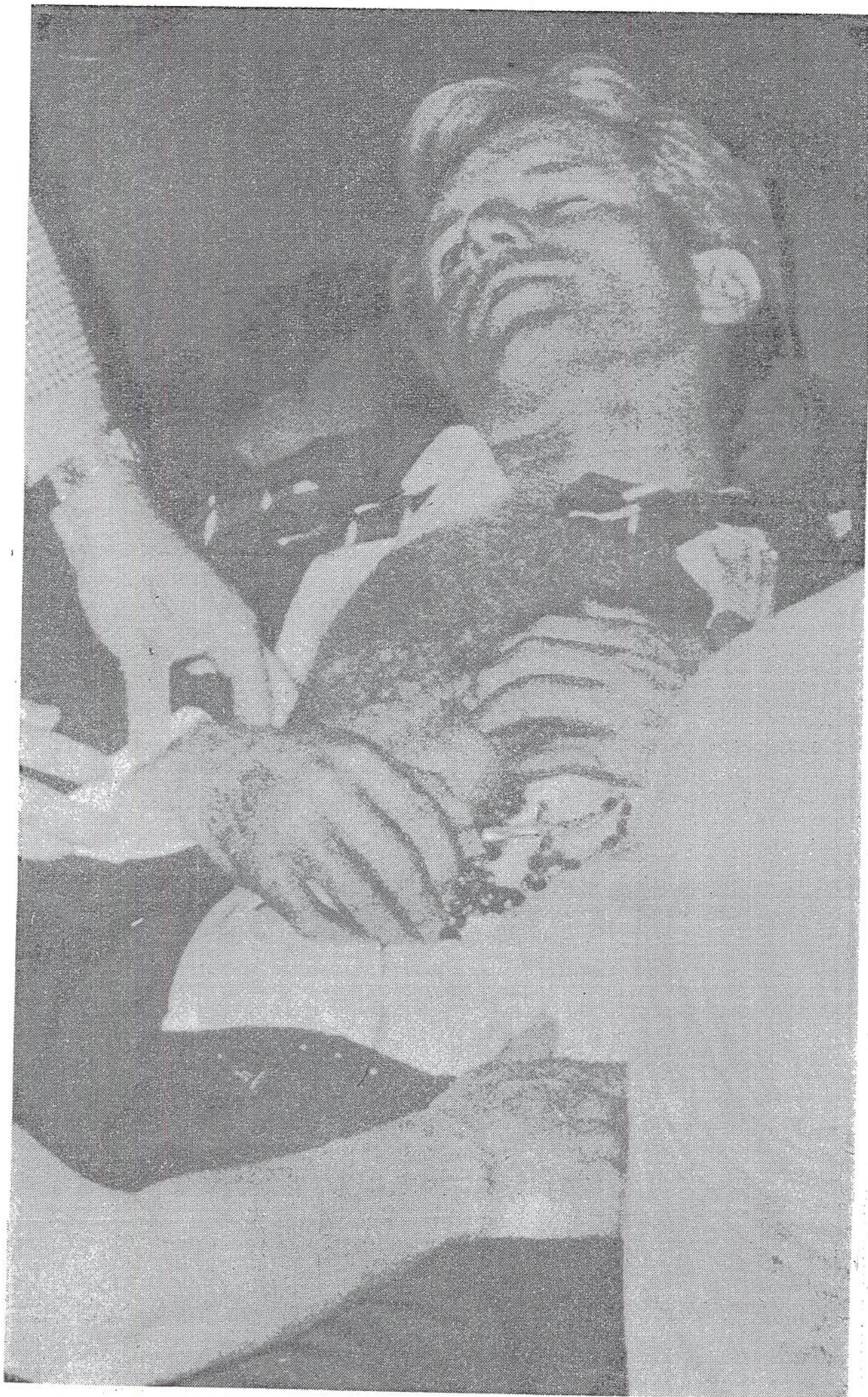
Clutching a rosary given him by a priest, Kennedy lies on floor of the hotel