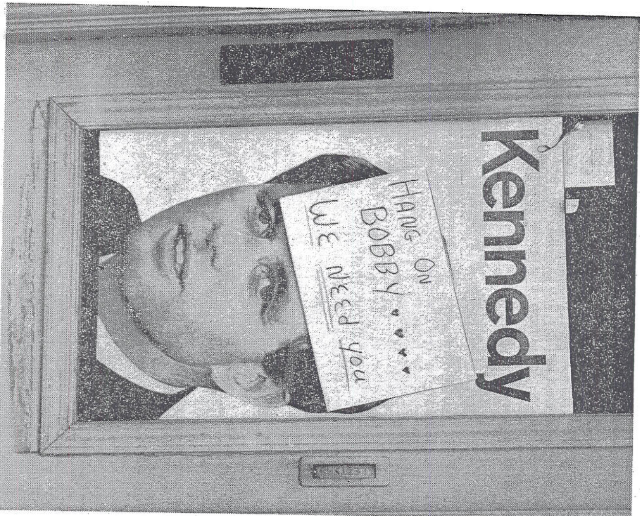
Kennedy for President headquarters at 59 Grand Avenue in Oakland was quiet today. A hand-lettered sign implored stricken candidate to 'hang on.'