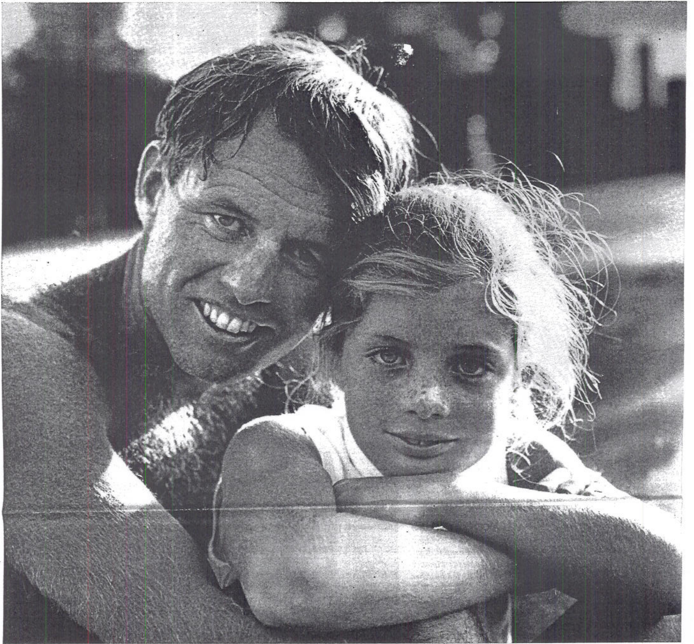
Robert F. Kennedy and his niece Caroline, age 7, at Hyannis Port in August 1965