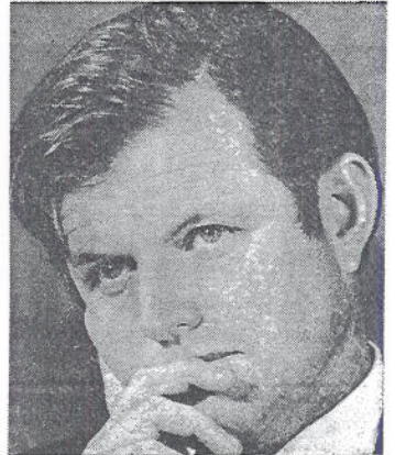
SENATOR Ted Kennedy. Miss Kopechne drowned in his car.

bridge about 8:45 a.m. July 19, after being summoned by the Edgartown, Mass., Fire Department about 20 minutes earlier.