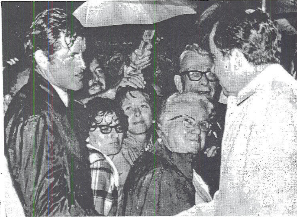
President Nixon returns from his round-the-world tour and greets Sen. Ted Kennedy among well-wishers at Andrews Air Force Base, Md. One result of the trip has been an Administration reassessment of U.S. global commitments.