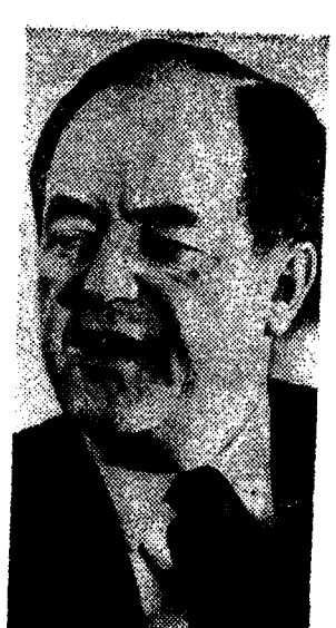
HUBERT HUMPHREY Talkative stability

bra (sign of peace) which appeal to the younger generation. But his Mercury is square to his Jupiter, which doesn't always give good judgment. His Mars is square to his Uranus, which gives a certain instability that will come out in June. But his reputation will increase tremendously over the next three months."