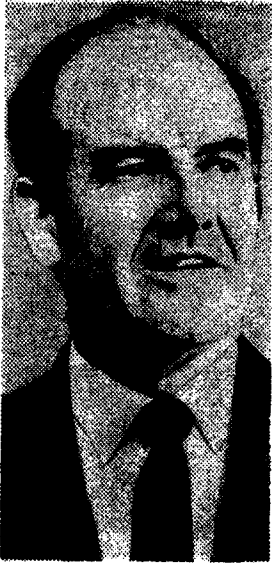
GEORGE MCGOVERN Very good memory