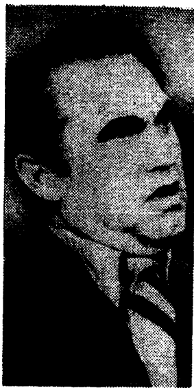
GEORGE WALLACE Hypnotic effect