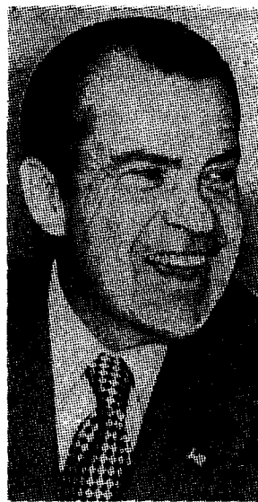
PRESIDENT NIXON Presidential horoscope