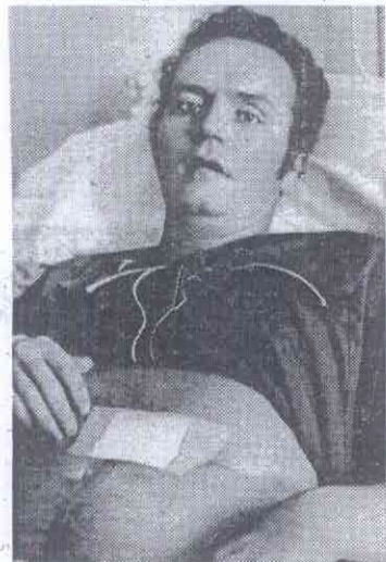
PUBLISHER Larry Flynt after being shot — allegedly to keep him from revealing new information on the JFK slaying.

Year after year we have continued to probe and only last winter — while the House Select Committee on Assassinations was still leaning toward the theory that there was no conspiracy — The ENQUIRER sifted through 40,000 pages of FBI documents and found: "Shocking new evidence that JFK assassin Lee Harvey Oswald did not act alone ..."