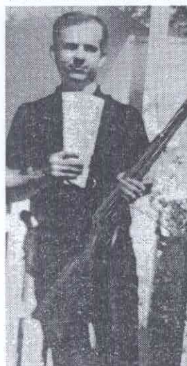
LEE HARVEY OSWALD: It is now officially thought that he did not act alone.