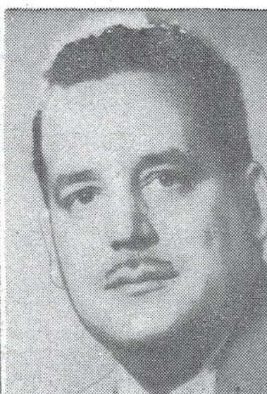
LEE HARVEY OSWALD . . . DAVID W. FERRIE . . . GUY BANISTER . . . SERGIO ARCACHA SMITH All linked to Central Intelligence Agency or anti-Castro activities