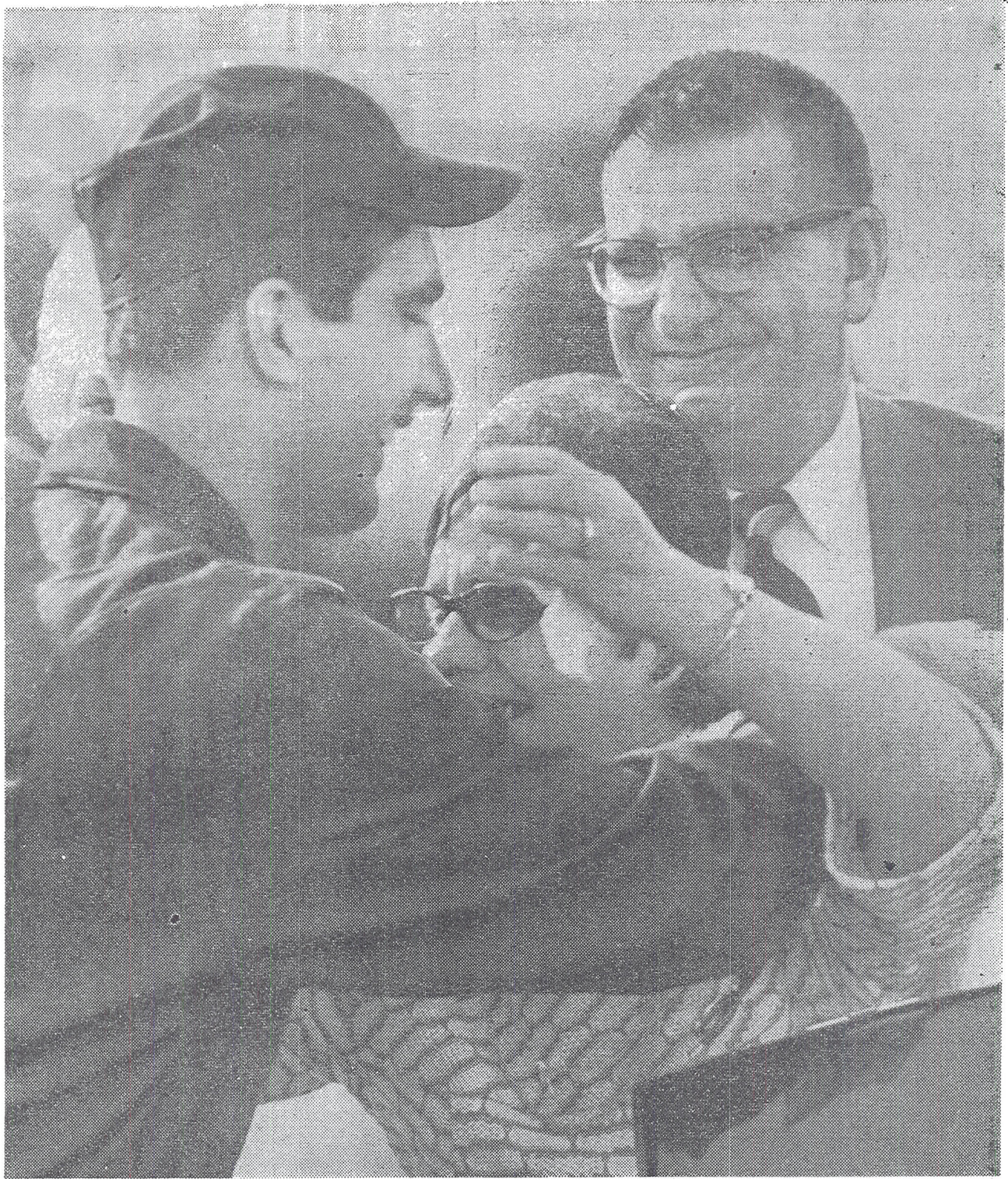
A Pueblo crewman got an emotional greeting from his parents