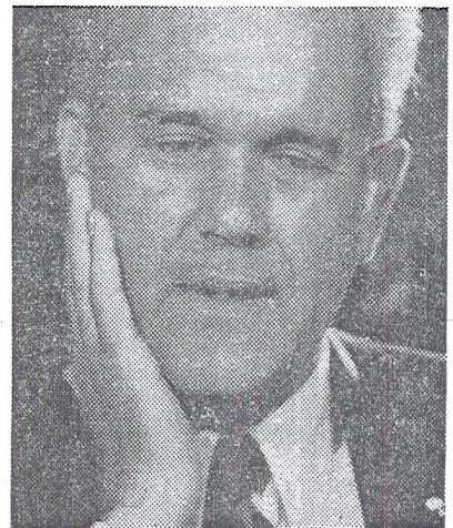
Col. Fletcher Prouty