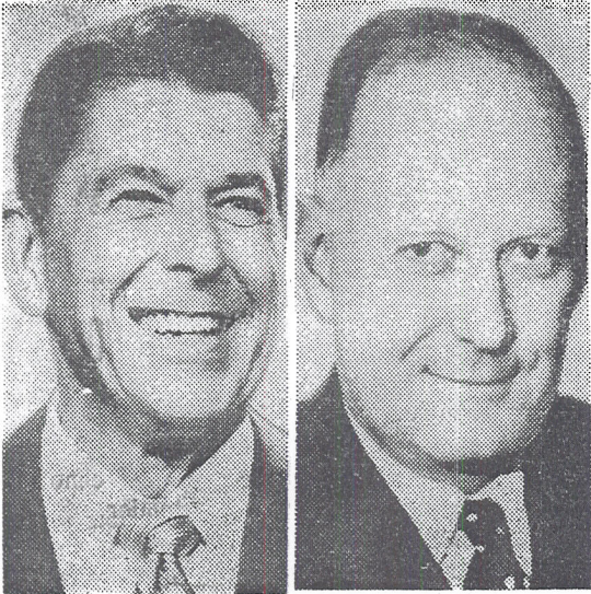
RONALD REAGAN DOUGLAS DILLION