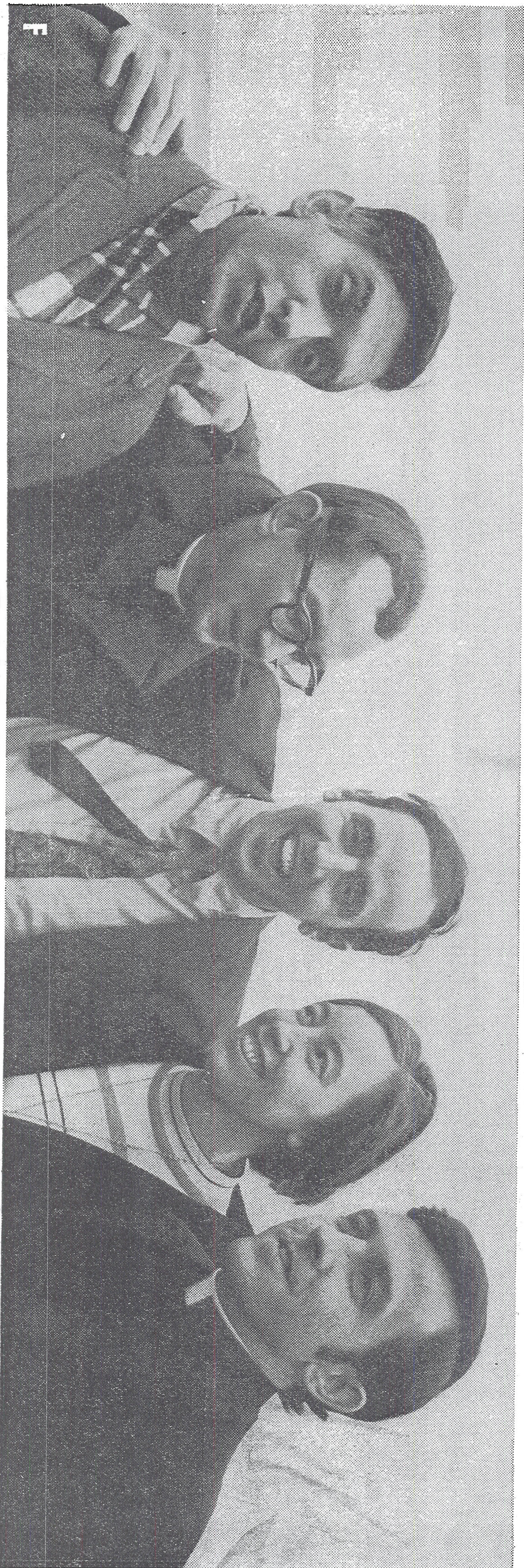
The "plot" to kidnap Henry Kissinger.