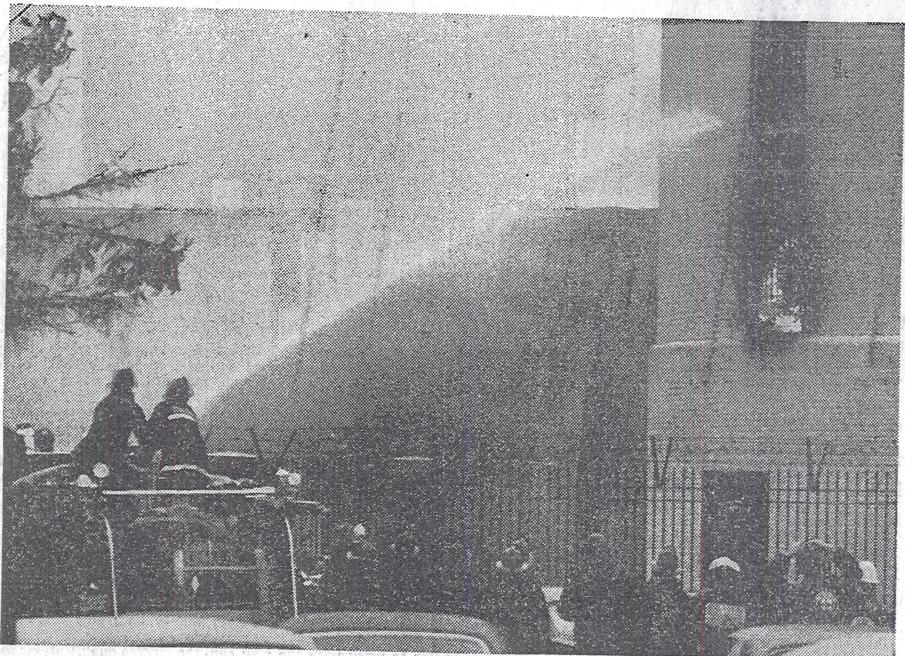
FIRE AT RAHWAY: Firemen fighting a blaze in the wing held by rebellious inmates at the Rahway state prison