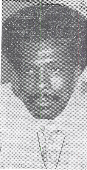
The New York Times