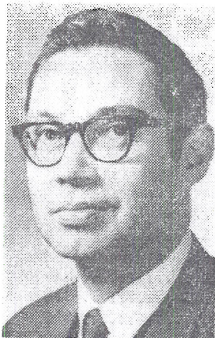
DR. JOHN EDLAND The medical examiner

State officials believe the riot was planned weeks in advance by black militants and Puerto Ricans. About 55 percent of the prison's 2200 inmates is black. There are no black guards among the prison's 380-man security forces, and only one Puerto Rican.