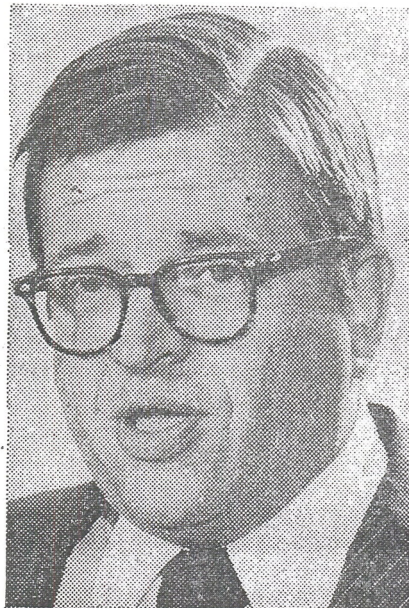
CHARLES W. COLSON