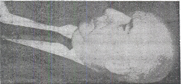
John N. Mitchell arriving at court on Tuesday.