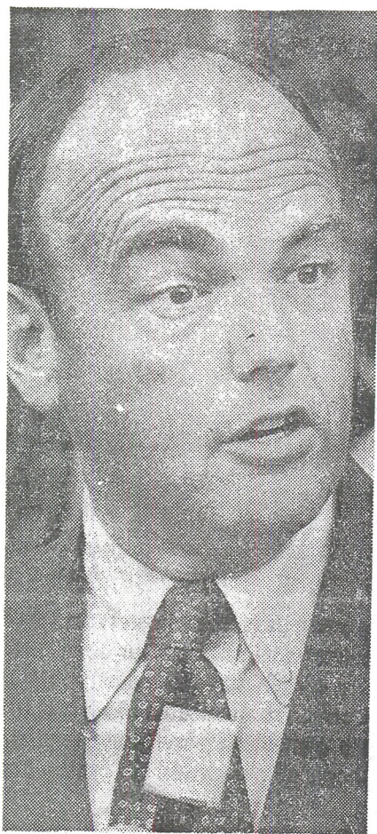
JOHN D. EHRLICHMAN ... fighting July conviction

in New York was $393,346 plus $79,044 in expenses. Since Mitchell was acquitted, the tab has been paid, or soon will be, by the trust fund in charge of leftover funds from the Nixon campaign.