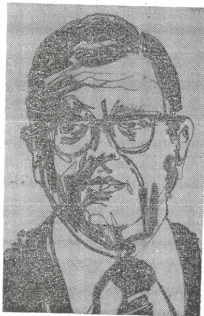
By Bill Oakes for The Washington Post