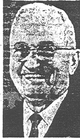
HARRY S. TRUMAN ... steel mills seizure

In arguing that the particular tapes Cox has sought are privileged, Mr. Nixon's lawyers may cite the so-called Jencks Act in which Congress provided that the government may refuse to disclose material that a court orders it to produce