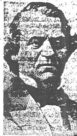
ANDREW JOHNSON ... reconstruction act

"The court will take into account all proper considerations, including the importance of maintaining the integrity of the executive decision-making process. But no executive official can be given absolute authority to determine what documents in his possession may be considered in its task."