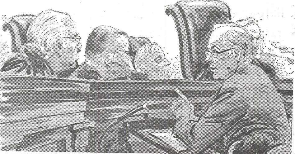
James D. St. Clair, Presidential lawyer, presents his argument. From left: Associate Justices Thurgood Marshall, Potter Stewart, William Douglas and Chief Justice Burger.